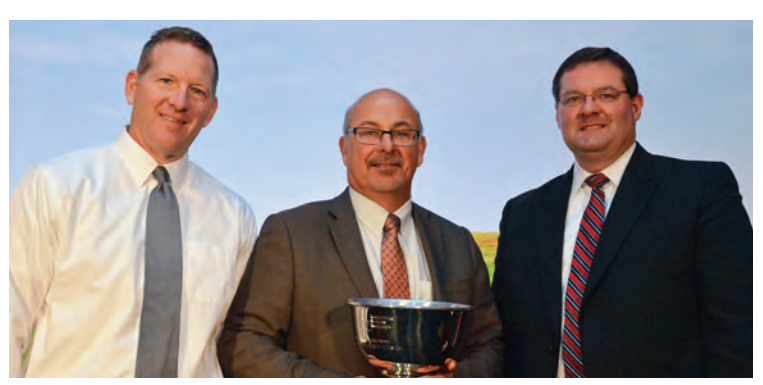
ARA RETAILER OF THE YEAR

Presented by Monsanto and AgProfessional