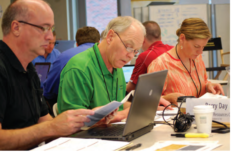
More than a dozen ag retail professionals participated in the Strategic Decision Making seminar hosted by Purdue University and ARA June 23-25, 2015.