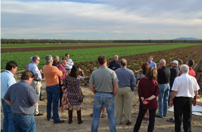
More than 30 attendees participated in the Coachella Valley Agricultural tour Dec. 3 following the ARA Conference & Expo. Attendees toured vegetable fields and a date processing facility.